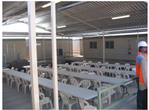
Outdoor BBQ area